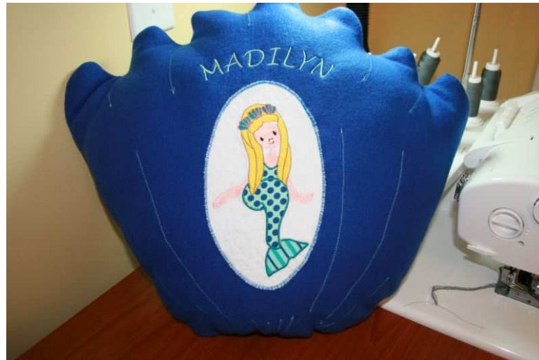
Finished Mermaid Pillow

Description: This pattern was designed to show a simple machine applique, quilting and felt to make a sweet pillow. The project can be completed in a couple of hours. Full color pictures are included.