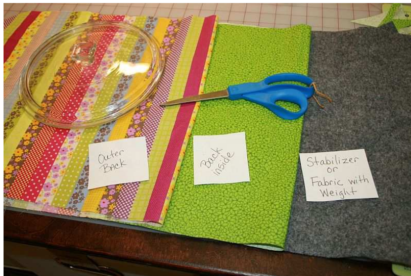
Project Components labeled

Description: This technique was designed for a simple way to keep organized while sewing projects on the fly.