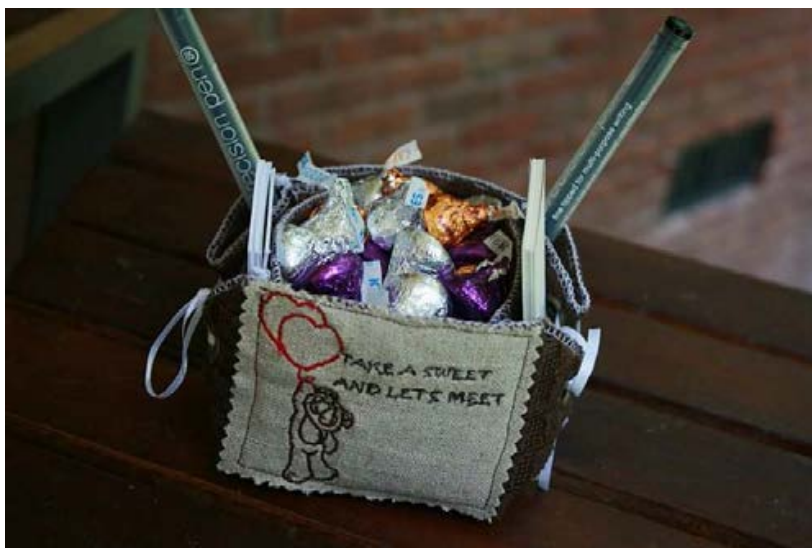
Finished Fabric Basket

Description: This pattern is for a fabric basket to promote networking at any event. The material used is a purchased dish drying mat that incorporates eyelets and ribbon. The design of the basket shape is not new and many variations can be found although using the chosen materials, particular message design and purposing for networking is unique.